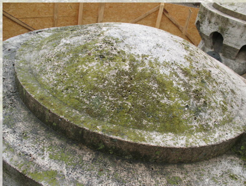
Ilustrație: Licheni pe suprafața pietrei Illustration: Lichens on the stone surface

Keywords: sculpture, monumental sculpture, statues, conservation, reinforcement, degradation, biodegradation, biological factors, stone, analysis of materials, Cluj-Napoca.