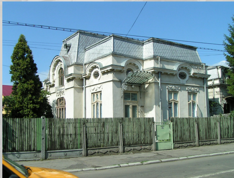
Ilustrație: Arhitectură rezidențială pe str. Col. Buzoianu Illustration: Residential architecture on Col. Buzoianu St.

Keywords: historic towns, historical surveys, urban development, restoration, conservation areas, town planning, Buzău, Romania.