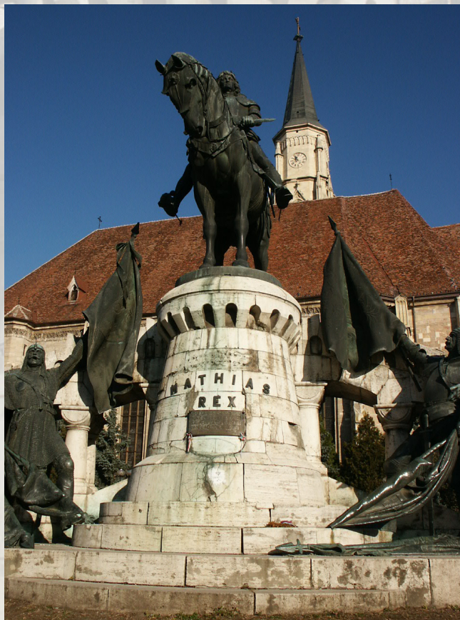
Illusztráció: A bástyán álló győzelmes király alakja Illustration: The figure of the victorious king standing on the bastion

Keywords: sculpture, monumental sculpture, statues, public monument, historical study, historicism, FADRUSZ János, Cluj-Napoca.