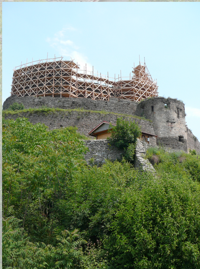
Illusztráció: A felállványozott dévai felső vár Illustration: The upper bailey of Deva Castle with scaffolding

Keywords: fortifications, castles, conservation, restoration works, structural surveys, structural elements, reinforcement, archaeological excavation, Deva, Romania.