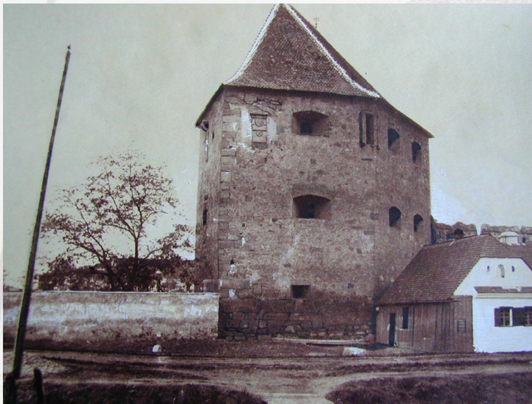
Ilustrație: Bastionul Bethlen (Ferenc VERES) Illustration: Bethlen Bastion (Ferenc VERES)