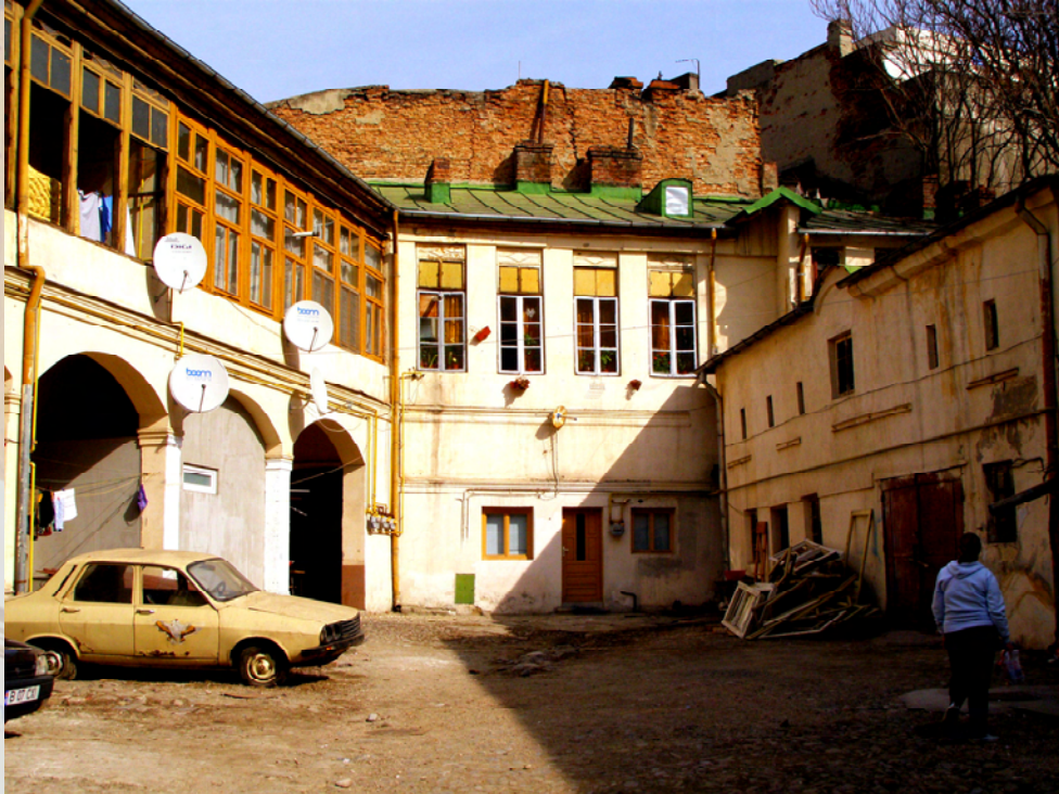
Ilustrație: Ansamblul curții interioare – zona de anexe și grajd Illustration: The inner courtyard – outbuildings and stable

Rezumat: Hanul Patria este unul dintre puținele hanuri bucureștene, de perioadă târzie, care s-a păstrat într-o măsură covârșitoare într-o stare acceptabilă, în ciuda degradărilor destul de avansate, dar care nu au afectat încă imaginea arhitecturală de ansamblu a monumentului. Din acest motiv, se justifică necesitatea intervenției cât mai rapide, o funcțiune nouă compatibilă cu cea veche, de han, fiind un hostel pentru tineret. De asemenea, cercetările de arhivă și studiul fațadelor permite o reconstituire a imaginii inițiale a fostului han de mare importanță pentru arhitectura veche a capitalei.