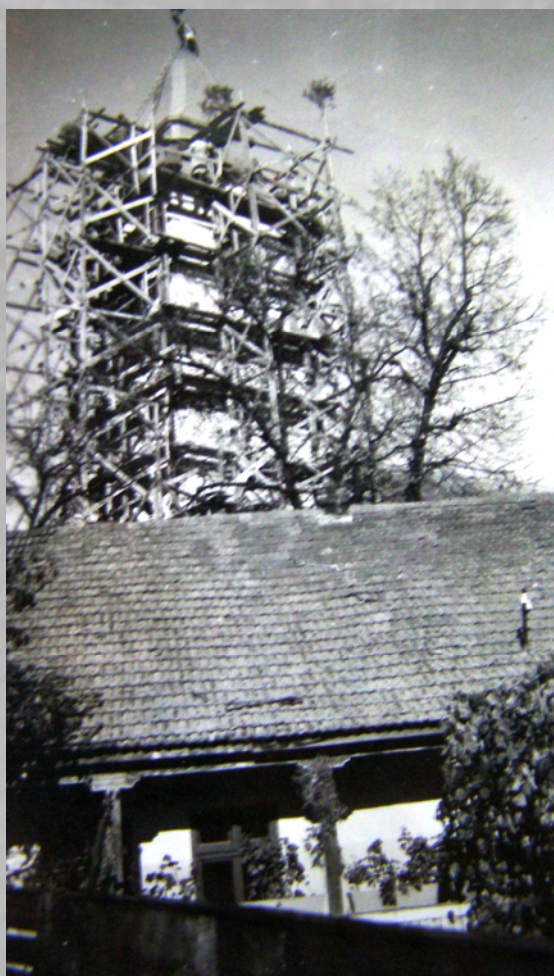
Ilustrație: Turnul bisericii în timpul intervențiilor Illustration: The church's tower during the interventions

Keywords: conservation, built heritage, communism, case study, Florești Commune.