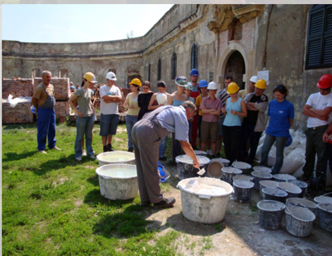
Ilustrație: Prepararea mortarului în cursul practicii de specialitate (iulie 2009) la Bonțida, județul Cluj Illustration: The preparation of plaster during the professional practice (July 2009) at Bonțida, Cluj County

Keywords: Cluj-Napoca, postgraduate training, THBCS, TTF, BBU, built heritage, conservation.