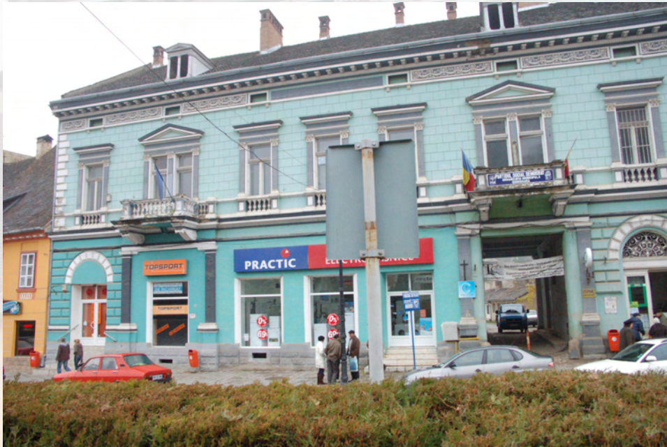
Illusztráció: A H. Oberth tér arculata: a földszinti változások Illustration: Aspect of the H. Oberth Square: transformations of the ground floor

Kivonat: A XX. század fordulóján épült lakóház még ma is Teutsch-ház néven ismert. Méretei és stílusa folytán az épület tekintélyes megjelenése nagy hatással volt a tér arculatára. Különböző időszakokban átalakításokat eszközöltek az épület tulajdonosainak, illetve használóinak igényei szerint, amelyek az épületnek inkább kárára, mintsem hasznára váltak. Az alábbiakban az építmény egy helyreállítási és hasznosítási javaslatát mutatom be röviden.