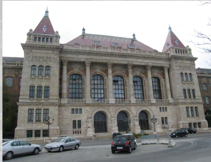
Illustration: The main building of the Budapest University of Technology and Economics Illusztráció: A Budapesti Műegyetem főépülete

Keywords: built heritage conservation, education, training